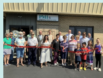
Waynesboro Center ribbon cutting ceremony on June 24th

With much joy the Waynesboro Office opened on June 1st and we had our first client that very day! She had been to the WIC Office just up the street. She saw our sign and came to see "what we had to offer." After a positive pregnancy test, she signed up for Earn While You Learn . Although not abortion vulnerable, we know we can offer her the love of Christ, education, and material support to help meet the needs of her little one. God has provided the perfect location - for even our sign! We covet your prayers for our clients (four in the first four weeks!) and that God will continue to send us the hearts that need us most. Thank you so much for your support!